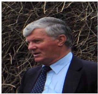
200 th Anniversary of Makerstoun Kirk – 31 st Augu